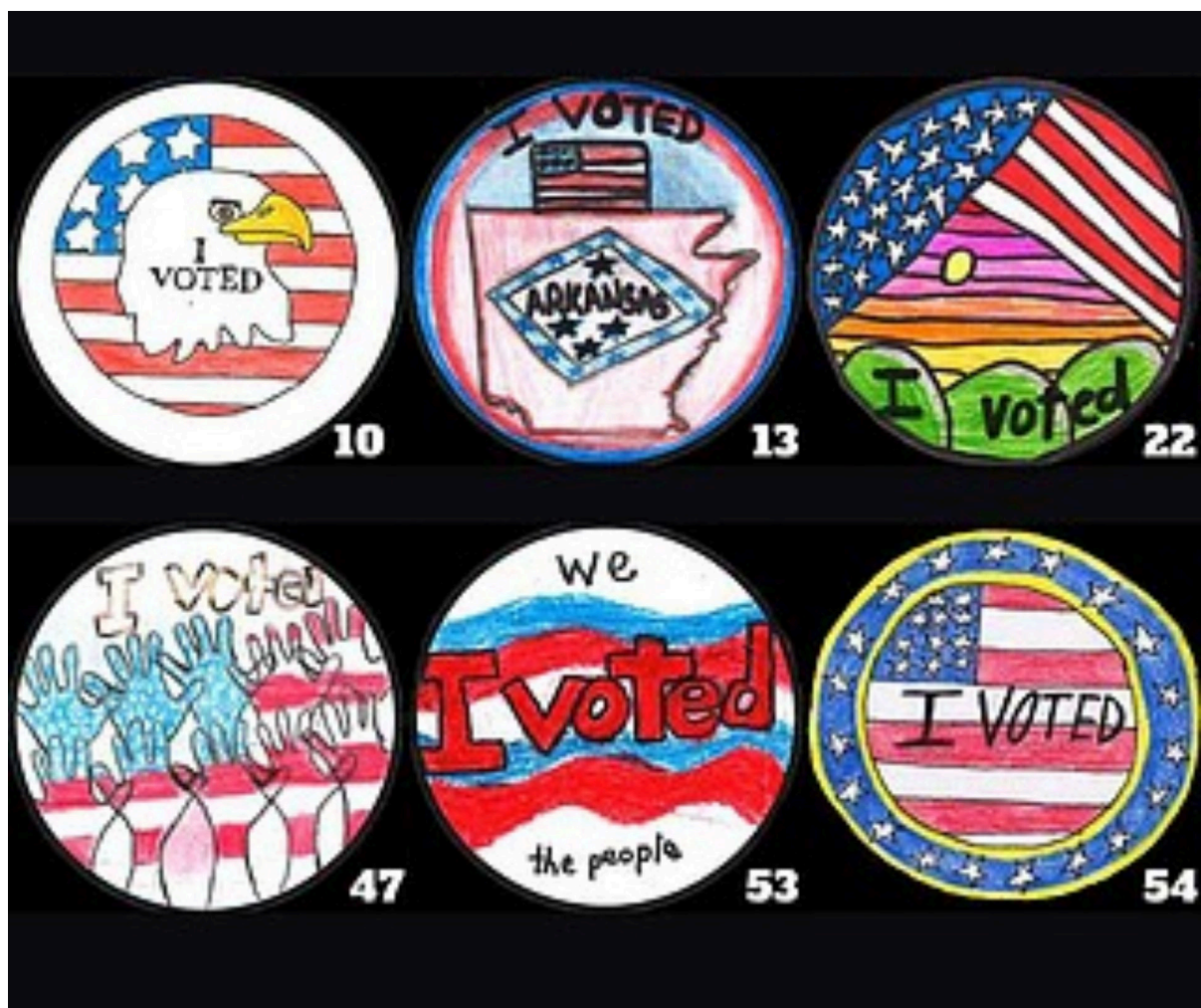
These are the Winners of the Arkansas "I Voted!" Sticker Contest.