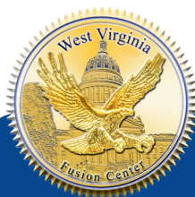
WV Fusion Center